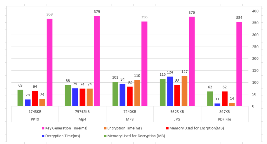
Figure 4: Graphical representation of encryption and decryption performance metrics for various file types using Blowfish and ECC.

The graphical representation in Figure 4 illustrates the encryption and decryption performance metrics for various file types using the Blowfish and ECC algorithms. Metrics such as key generation time, encryption time, decryption time, memory used for encryption, and memory used for decryption are compared across a range of file types (PPTX, MP4, MP3, JPG, and PDF). Each file's size significantly influences these metrics. Notably, JPG and MP4 files exhibit higher memory usage during encryption and decryption compared to smaller files like PDF. Blowfish and ECC's efficiency are reflected in the processing times and memory usage trends, highlighting their suitability for specific file types.